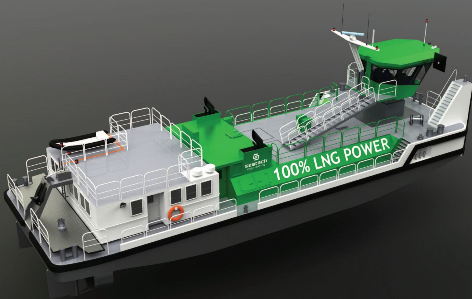
LNG pusher variant B